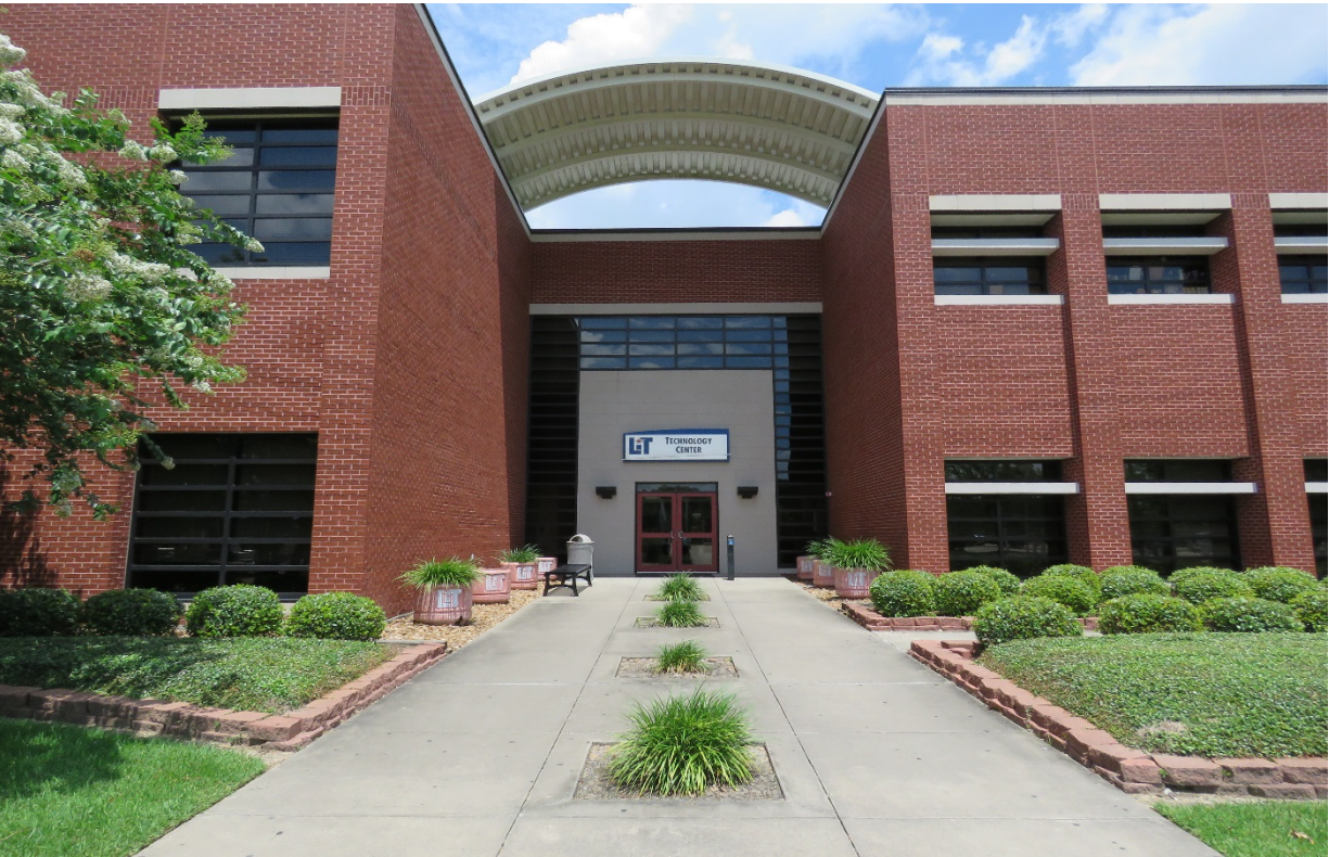
Lamar Institute of Technology - Technology Center