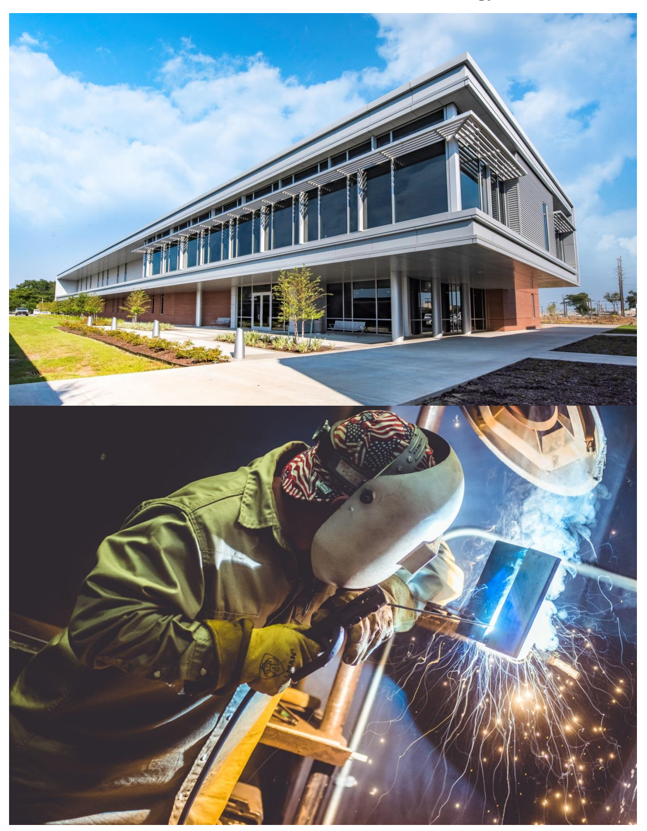
LIT Petrochemical and Advanced Technology Center