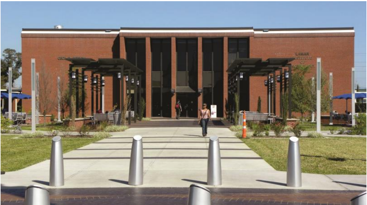
Lamar Institute of Technology Cecil Beeson Building