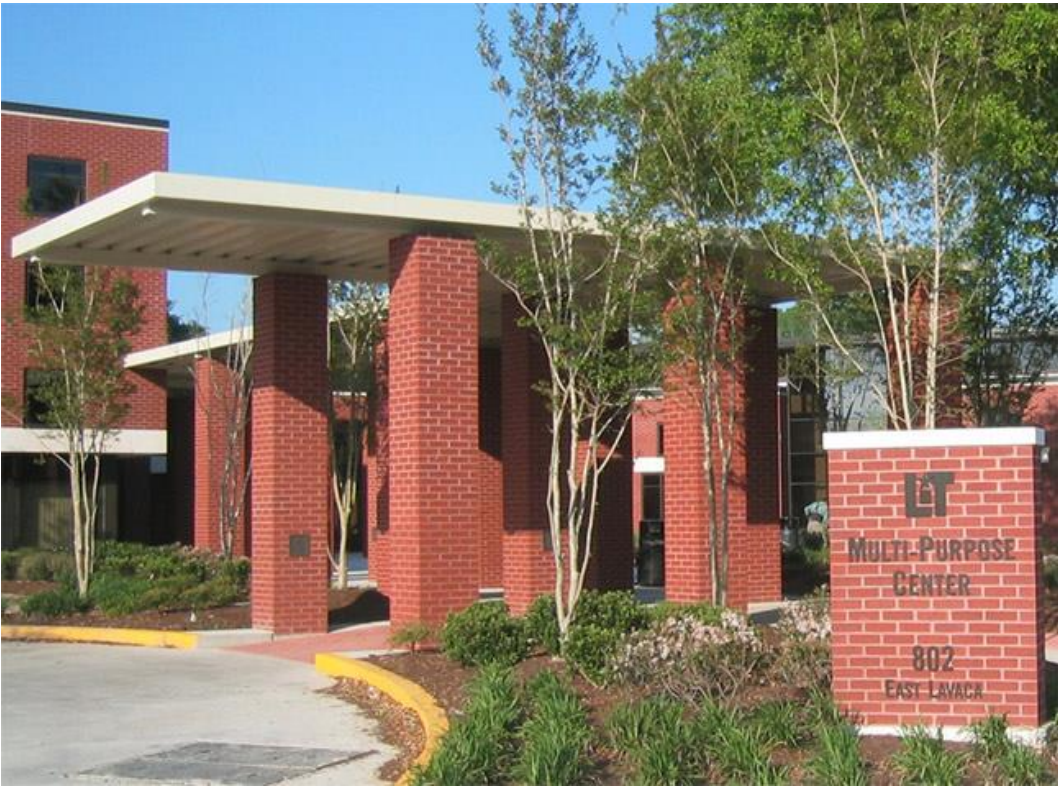
Lamar Institute of Technology Multi-Purpose Center