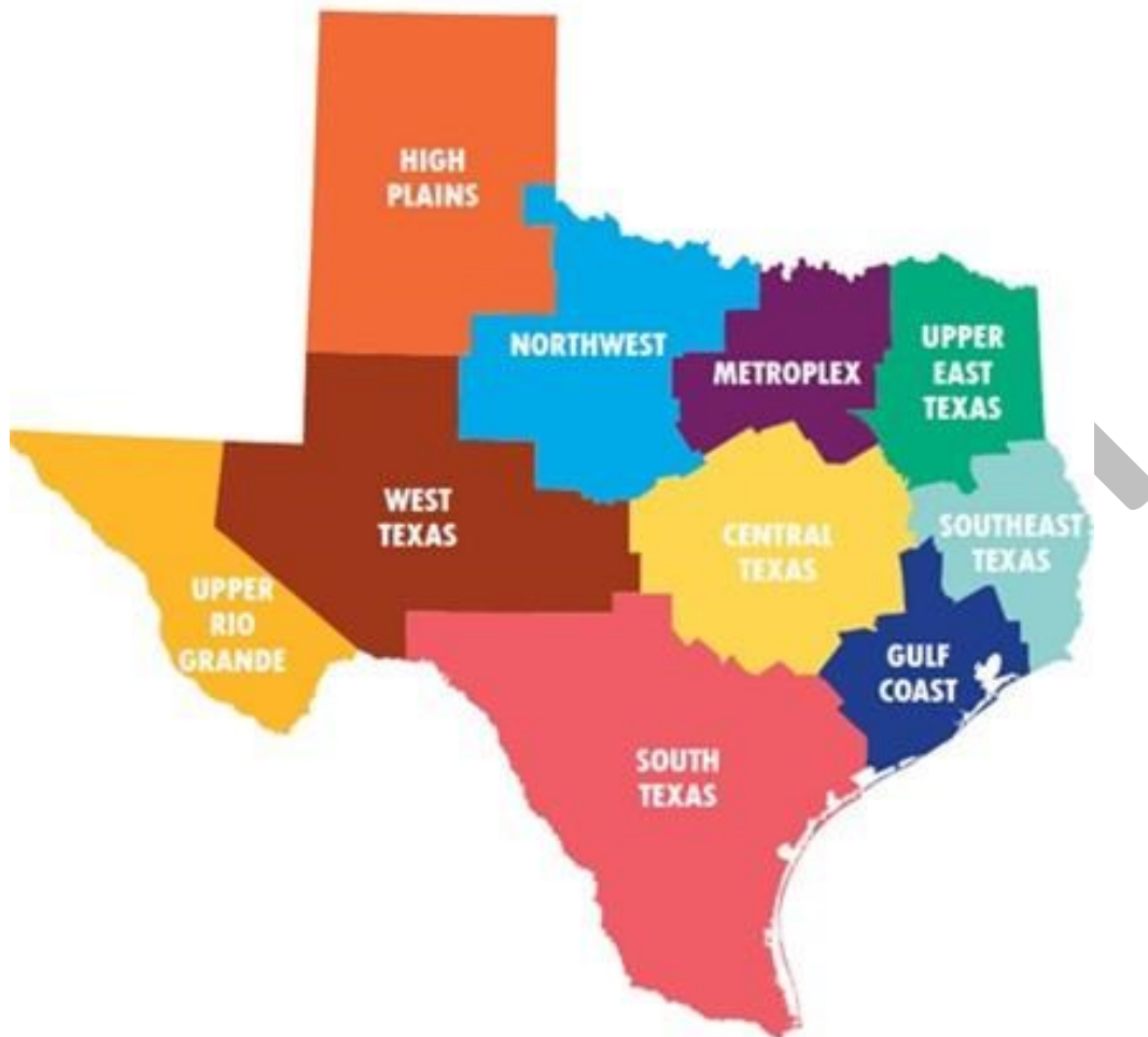
Figure 1. Texas Higher Education Coordinating Board's 10 regions.

Economics affect enrollment as well. Two-year college enrollment has usually expanded in times of increasing unemployment, in part because students want to update their skills to prepare for better jobs or jobs in different fields. During the Great Recession, enrollments surged at two-year colleges, as seen from 2008 to 2010. The pattern of decreased enrollments at two-year schools from 2011 to 2014 were similar to what has happened many times before; when the economy improves, many students, especially at the two-year level, bypass higher education for the workforce.